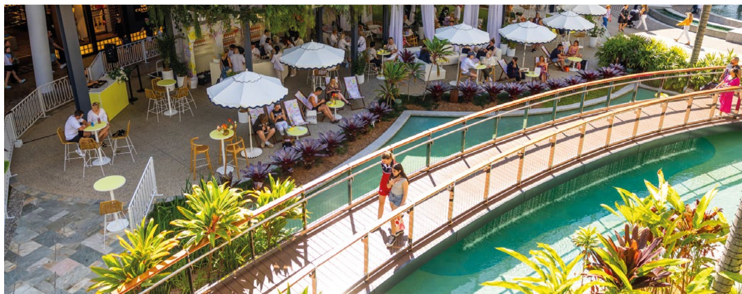
Pacific Fair Shopping Centre, QLD

The Board Charter, which is available on the GPT website, sets out the role of the Board and Management, including matters expressly reserved for the Board. The Charter also includes a description of the role of the Chairman and matters delegated to the CEO which includes: