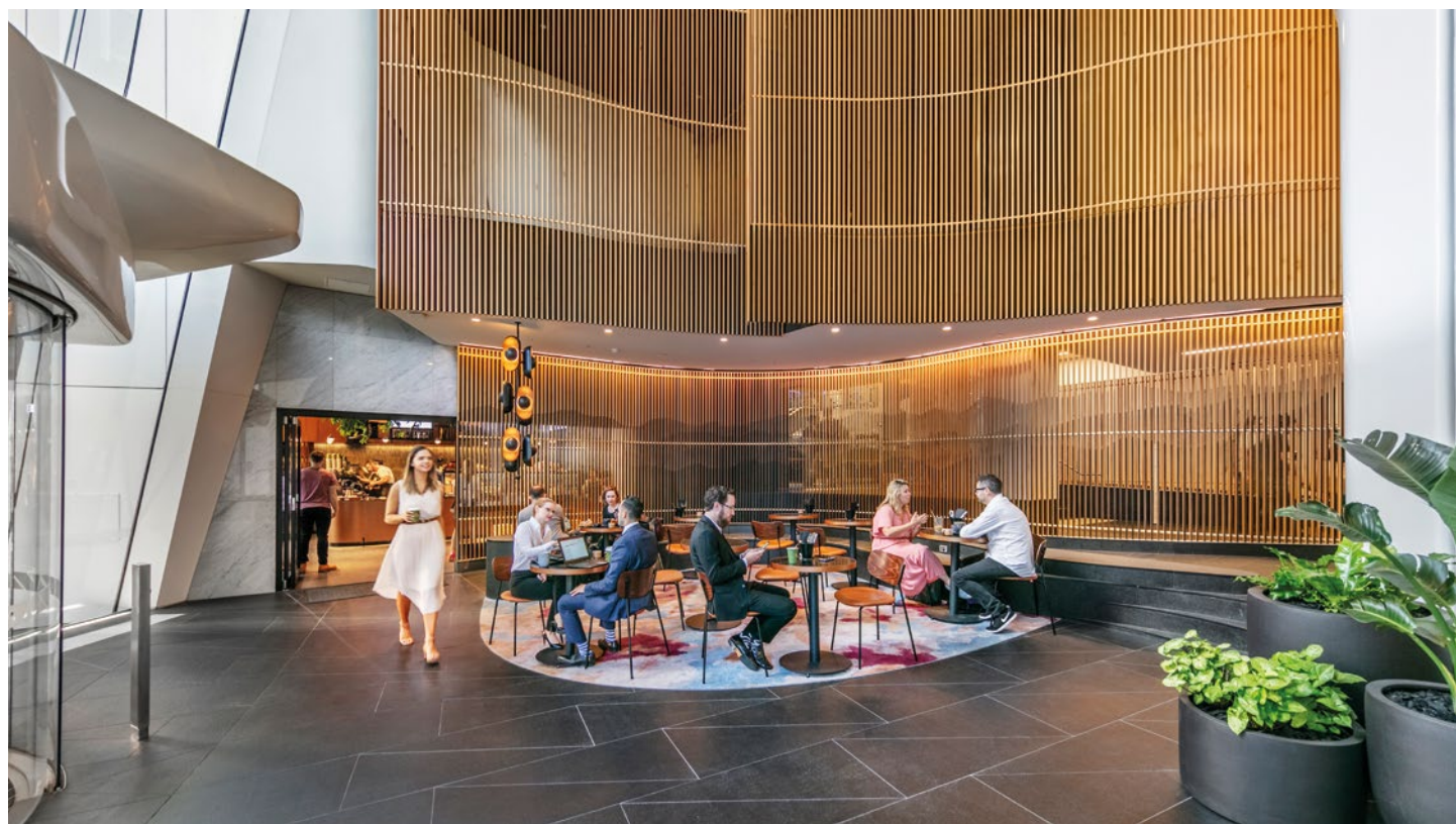
580 George Street, Sydney